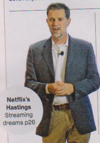
Netflix's Hastings Streaming dreams p26